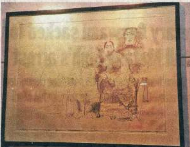
(Top) A Miguel Rasero, mixed media on wood (Above) A Pablo Picasso, 'Portrait de Famille', Homme Aux Bras Croises, 1962, Litography