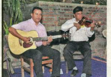
Some lovely music added to the ambience