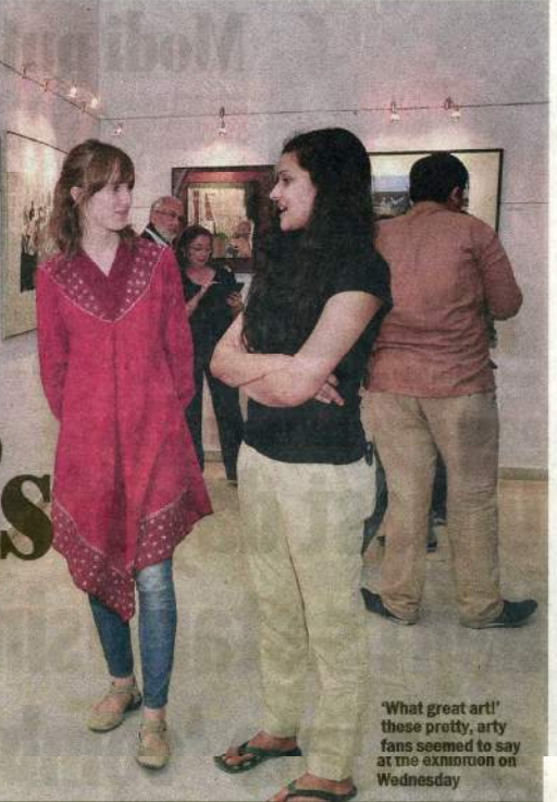
'What great art!' these pretty, arty fans seemed to say at the exhibition on Wednesday